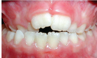
Crossbite of Back Teeth

Top teeth are to the inside of bottom teeth