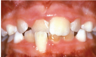
Crossbite of Front Teeth

Malocclusions (“bad bites”) like those illustrated below, may benefit from early diagnosis and referral to an orthodontic specialist for a full evaluation.